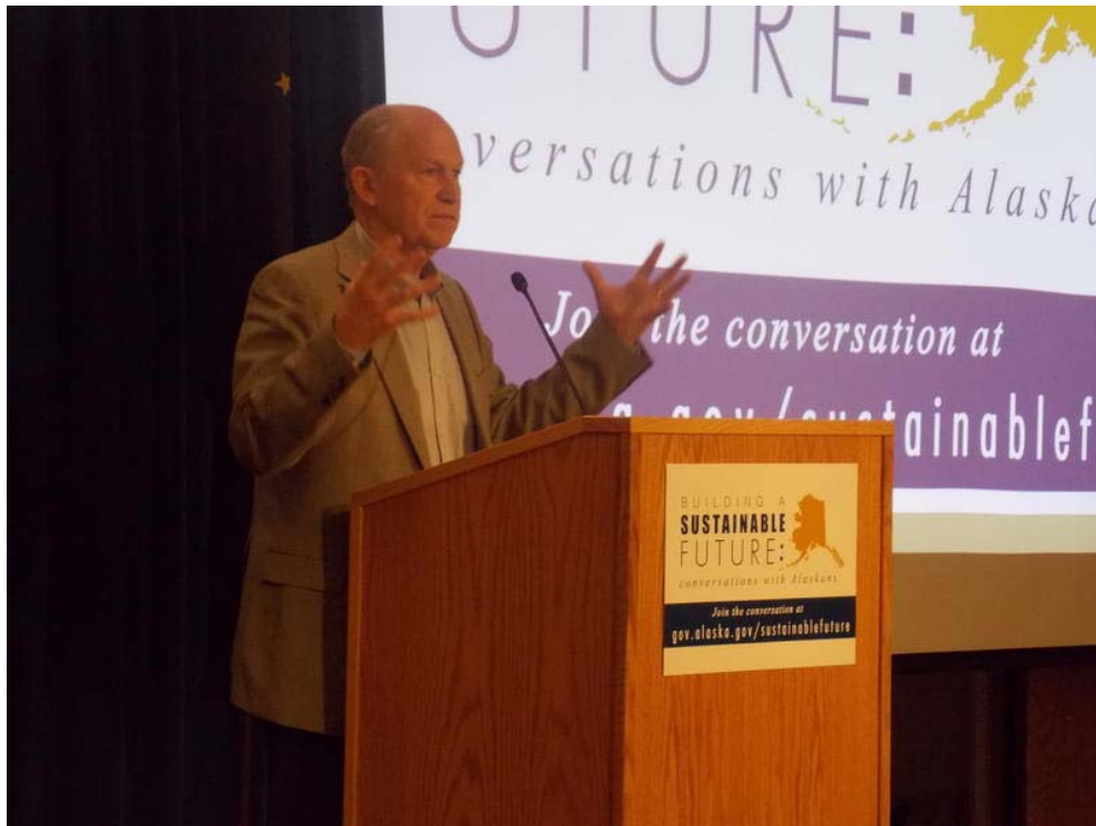
Governor Bill Walker delivers closing comments at the end of the weekend gathering.